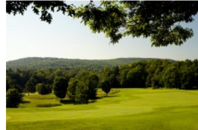
Quechee Golf Course

Golfers will enjoy several first rate golf courses. Hanover, Woodstock, Eastman and Quechee, Lebanon and Bradford each have fantastic golf courses in wonderful settings.