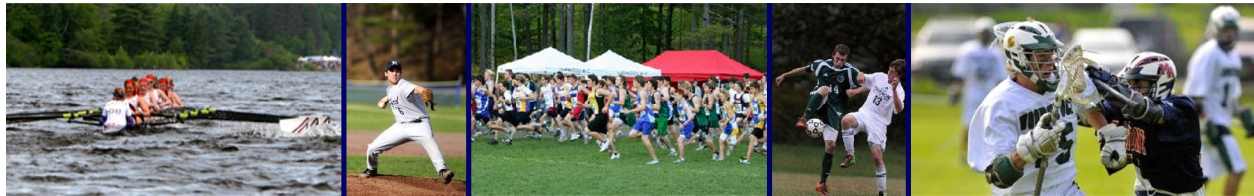
Upper Valley School Sports

The schools of the towns of the Upper Valley are highly rated and are well supported by the individual communities. The variety of the four seasons means that there is a wide range of sports that children may participate in. Soccer, Football and Field Hockey are key fall sports which lead into skiing, skating, ice hockey and basketball in the winter. In the spring the sports turn to baseball, track and field and lacrosse.