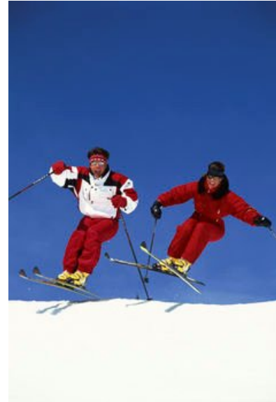
The Upper Valley is close to many fine ski resorts.

The Upper Valley also enjoys a number of fine cross country ski areas where you can get out into the woods on well marked and well maintained trails. The area golf courses also allow cross country skiing and some also set up ski skating tracks