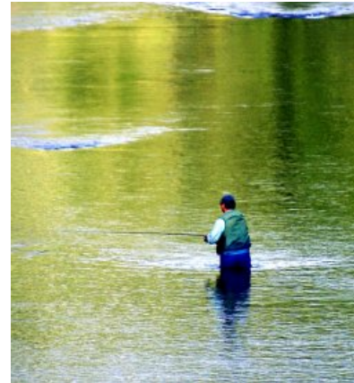
Fishing on the Ottauquechee River in Woodstock

The Upper Valley has something for every fisherman.